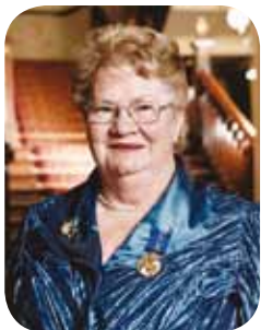
June receiving the Order of Australia Medal in 2011